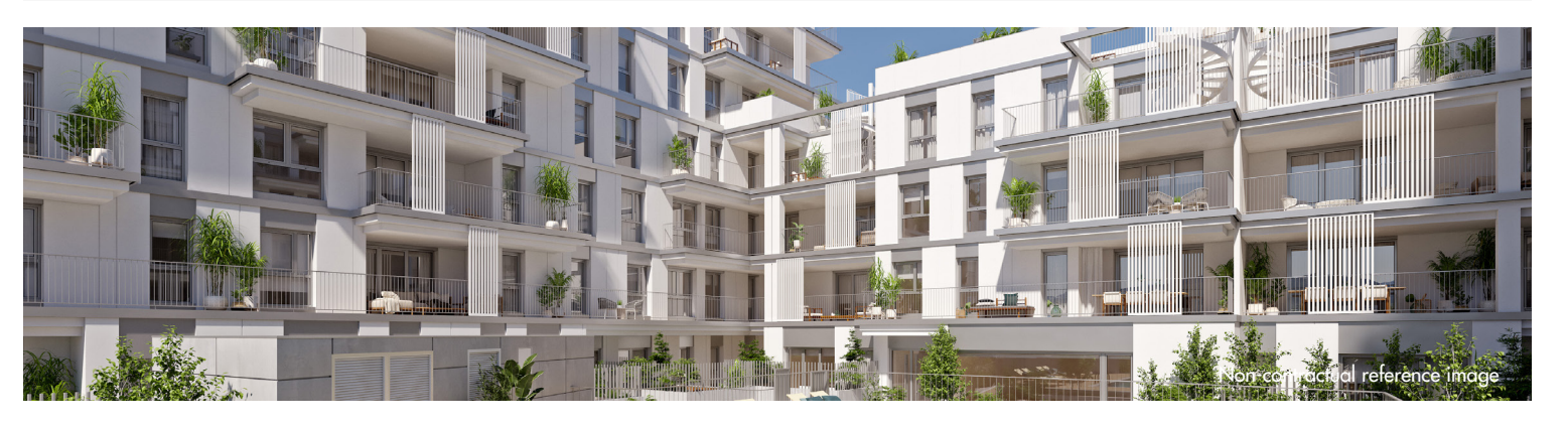
We build in compliance with the Technical Code for Construction and applicable regulations.

chety Enticlency extinicate available at the Sales Office as well as in the Download section of the "Downloads" section of the project page at www.avantespacia.com. Any variation that may occur between the Energy Efficiency Certificate of the Project under construction and the Energy Efficiency Certificate of the finished and completed Project will not affect the Letter indicated in the Energy Rating.