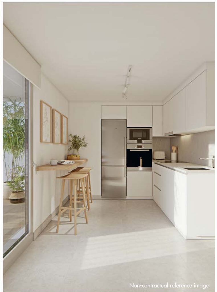
Non-contractual reference image