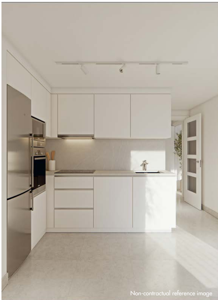
Non-contractual reference image