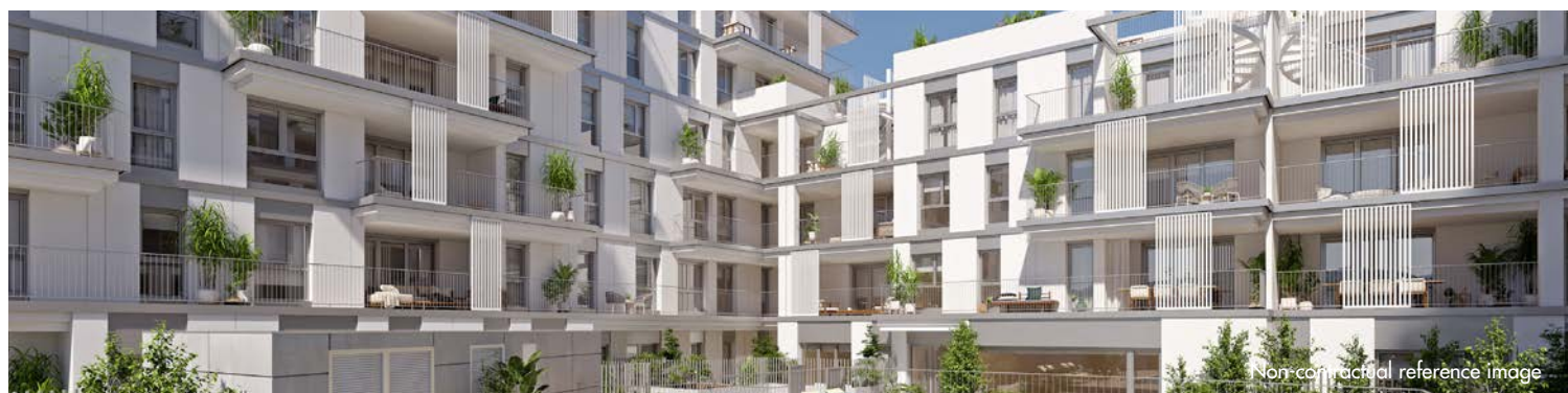
Non-contractual reference image

Energy Efficiency Certificate available at the Sales Office as well as in the "Download" section of the "Downloads" section of the project page at www.avantespacia.com .