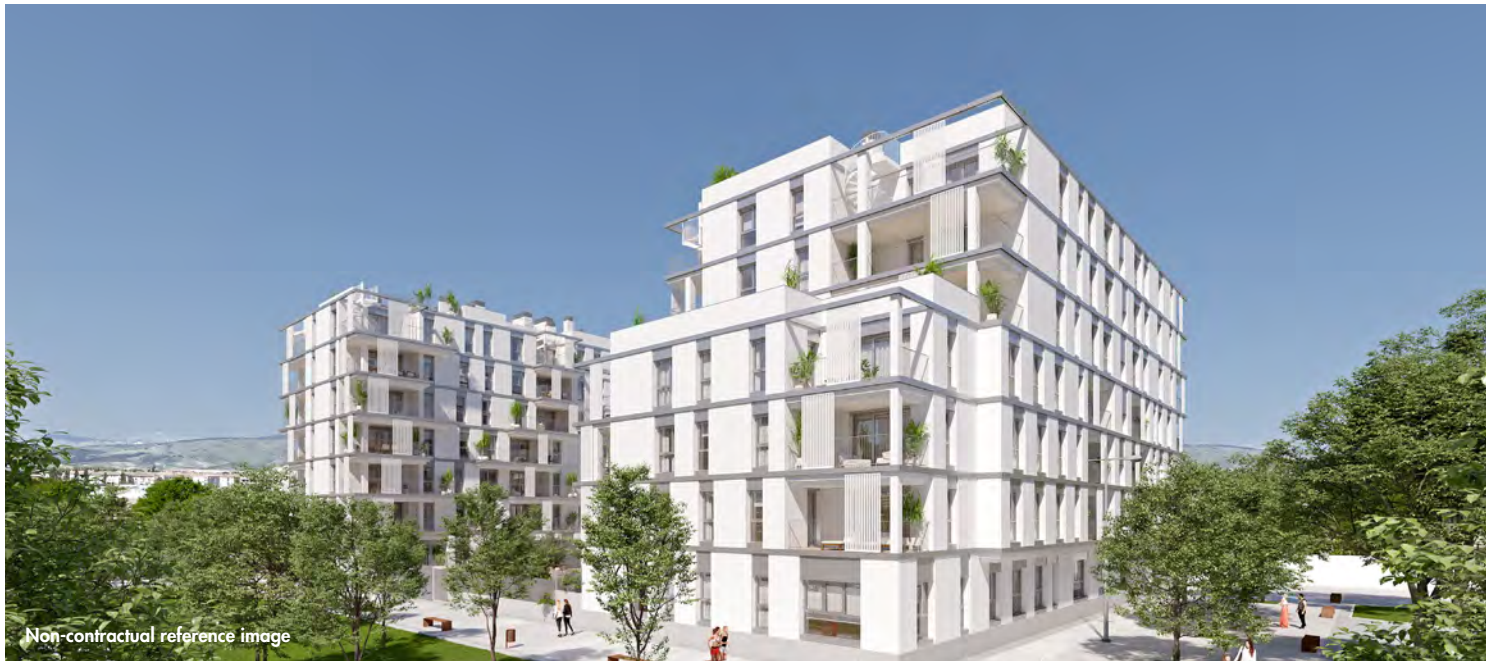
Non-contractual reference image