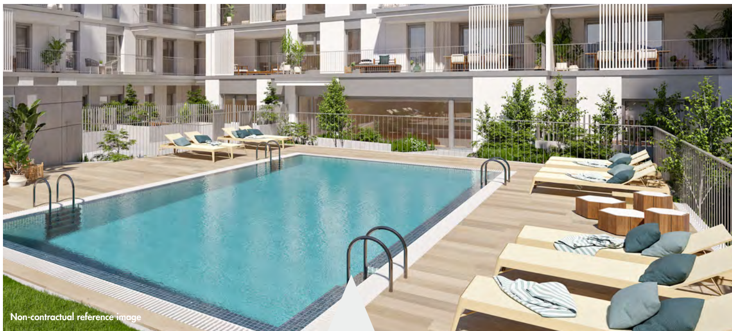
Non-contractual reference image

In Palma de Mallorca, in the Nou Llevant sector, in a privileged location, specifically where the Avinguda Mèxic and Carrer Puerto Rico streets meet, in a new residential complex 500 metres from the Portixol and the Ca'n Pere Antoni beach.