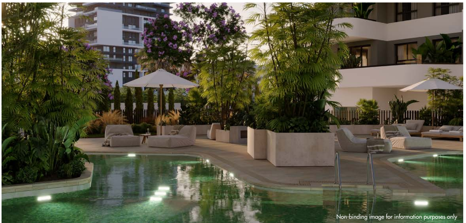
Non-binding image for information purposes only

Energy Efficiency Certificate available in the Commercial Office as well as in the "Downloads" section of the promotion information sheet at www.avantespacia.com . Any variation that may occur between the Energy Efficiency Certificate of the project and the Certificate of completion of work will not affect the letter indicated in the Energy Rating.